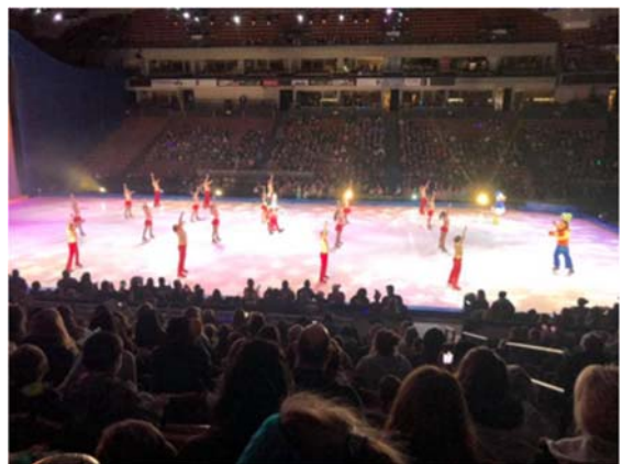
Thanks to all who attended our annual trip to Disney on Ice!